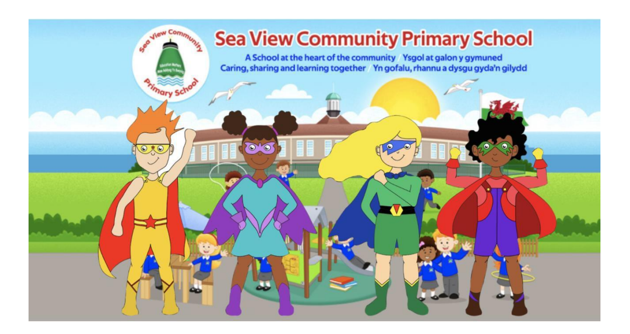
Sea View Community Primary School